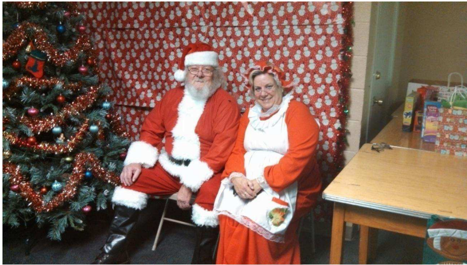
Eagle's Nest