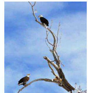
Eagle photos by Brad Powell