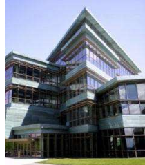
THE FRATERNAL ORDER OF EAGLES DIABETES RESEARCH CENTER AT THE UNIVERSITY OF IOWA