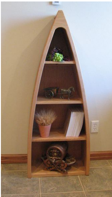
Wood Canoe Bookcase

Please stop by the dinner and see the assortment of 'goodies' even if you did not golf during the afternoon.