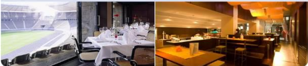
Our images show the Executive Club P and the Executive Club D's catering area. Seating arrangement may vary.