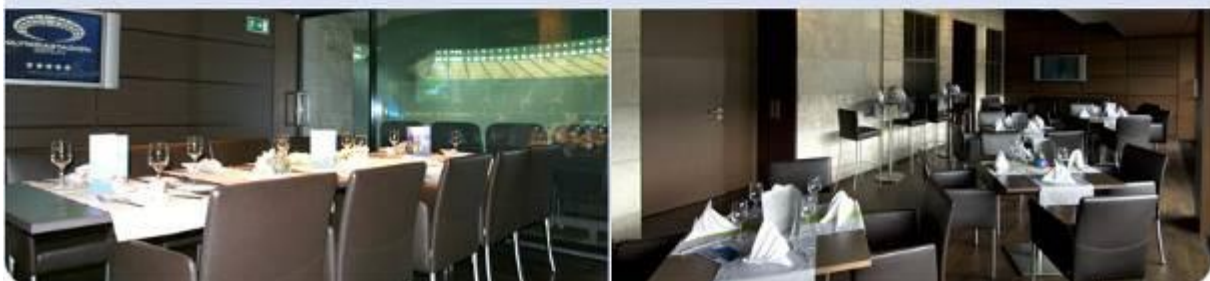
Our images show a ten (left) and a twenty (right) person box.

In front of our boxes on the VIP stand, a large terrace offers lots of room to celebrate and enjoy the atmosphere at the Olympiastadion Berlin.