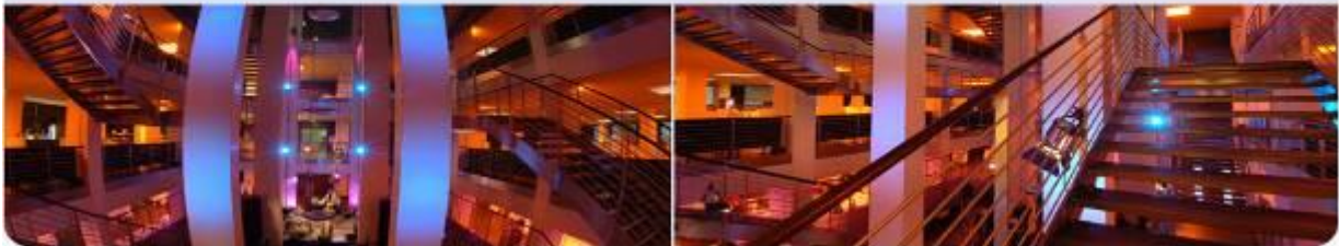
Our images show the atrium with its four levels.