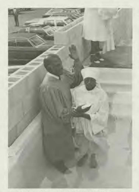
The first baptism at the new Mt. Sinai.