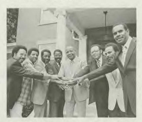
The Cleveland evangelistic team in Columbus.

The members of the three churches in the area really stuck by the meetings. They forsook the comforts of home for eight weeks, six nights per week, to engage in this missionary activity. Laodicean church members who leave their pastors to "walk alone" on the street corners of the cities need to visit Columbus, Ohio. These faithful pastors and laymen have a story to tell!