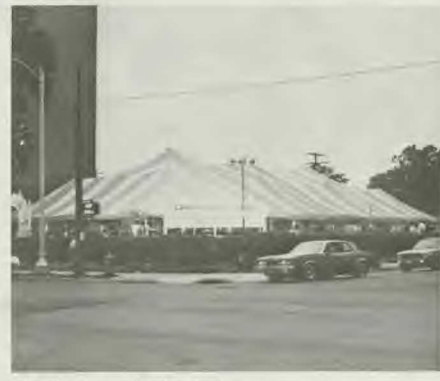
The Canvas Cathedral.

Our first and second baptisms were so large that we could not accommodate them. But the members and pastor of the Ohio Conference church in the area came to the rescue! Like true Christians should, they opened their doors and gave us free use of their ample facilities.