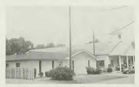
The North Side Seventh-day Adventist Church and educational facility in Pine Bluff, Arkansas.