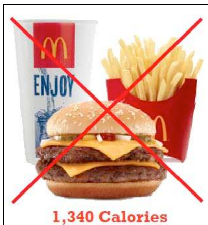
Make Healthy Lunch Time Choices

Healthy children learn better. When children eat right, they can improve their memory and their ability to concentrate. In addition, eating well supports healthy growth and development. We are encouraging all students to bring snacks to school that are wrapped in their own packages -- this means apples, bananas, oranges and other fruits. We are also asking parents to be aware of what your children are eating - and talk to them about making healthy choices.