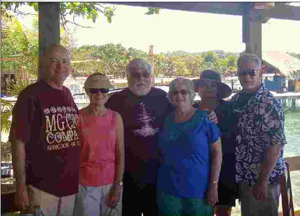
HMGCC members enjoying Roatan, Honduras