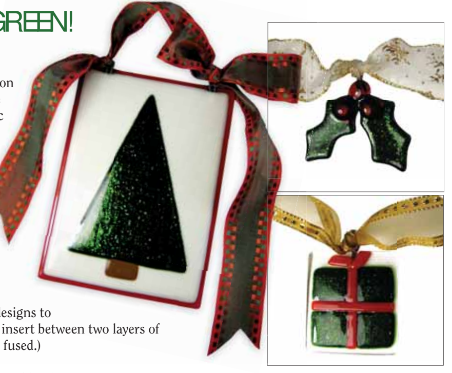
Holiday Decorations made with NEW Aventurine Green.

Now available from your System 96 Supplier. Stock #128AVSF