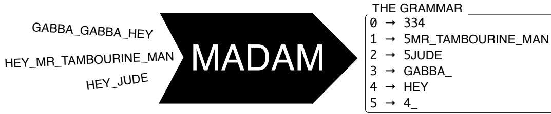
Figure 1: Context Free Grammar (CFG) inference illustrated

fix trees [23] and suffix arrays [14] for identifying most common shared substring of data elements (e.g. bytes) between different training data specimens. Each appearance of the selected substring was then replaced in the source data with one placeholder tag (called a “non-terminal”) that could be later expanded back. The process was repeated until the data could not be further compacted. Later, we have started favoring a simpler method whose variations we collectively call MADAM that does the same thing but just for digrams found from the training material. Later in our research we found out that a very similar linear time inference algorithm called RE-PAIR has been described earlier in data compression context [12]. While its implementation is fairly simple compared to e.g. SEQUITUR, turns out it produces grammars with comparable quality in terms of the Minimum Description Length principle.