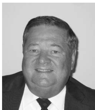
MAYOR JAMES WHITE