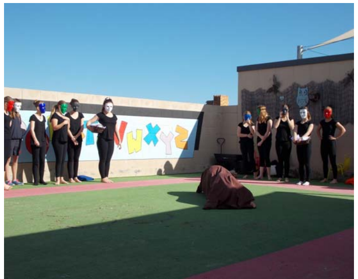
Centre point Childcare Centre Visit