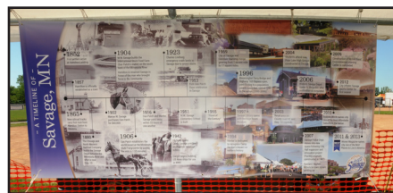
Timeline of the City of Savage's History starting from the early 1800's

to learn the history of our city. The banner is on display in the Heritage Room at the Savage Public Library.