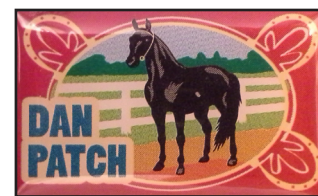
2014 MN State Fair Pin number 3, part of a 12 pin collection this year that when put together forms the shape of MN

This year, after the State Fair board approved of demolishing Heritage Square, which housed the story and memorabilia of Dan Patch, the new state of the art History and Heritage Center opened in what is now called the West End Market. In collaboration with the Minnesota Historical Society and after fundraising nearly 3 million dollars, an interactive, temperature controlled, ultra modern facility opened to much anticipation.