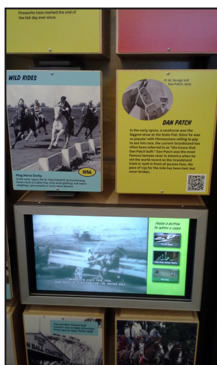
Part of the MN State Fair display of Dan Patch History