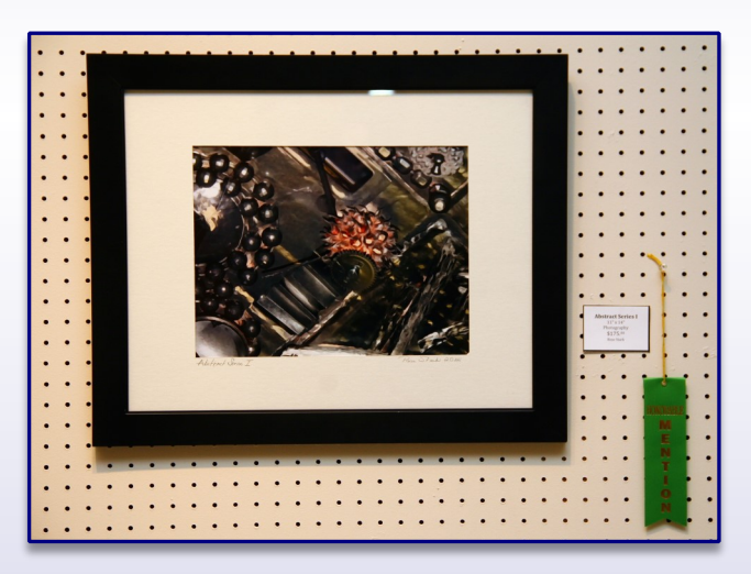
Honorable Mention- "Abstract Series 1" by Rose Stark