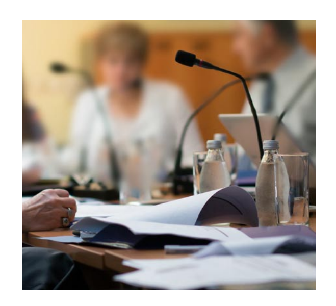
Exhibit space requests will be allocated on a first come, first served basis upon receipt of exhibit application form, signed agreement and paid registration fee. Painbridge organizer reserves the right to adjust booth space and number as necessary.