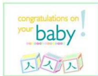
Discharge Packet Plastic zip-up pouch containing educational materials for HBsAg-positive women to be distributed after delivery upon discharge from the hospital