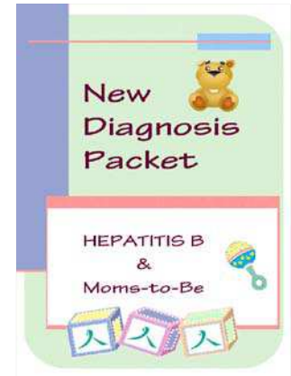
Diagnosis Packet Envelope containing educational materials for HBsAg-positive women and provider PHBPP referral form to be distributed during prenatal visits