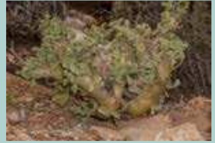
Pelargonium klinghardtense in habitat