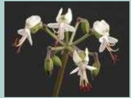
Flowers of Pelargonium laxum

Pelargoniums are mostly winter growing succulents that are well suited for our wet-winter, dry-summer climate in California. Although they are winter growers, they should be protected from frost. And the good news is that most of these species are very easy to grow, if attention is paid to providing an environment very similar to their South African home. Some species, such as P. echinatum and P. triste are tolerant enough to be naturalized in the ground in warmer California climates when given good drainage and protected from summer watering. Many species will not go dormant if watered all summer, but the plant health and appearance both suffer. Like most cacti and succulents, when in doubt don't water!