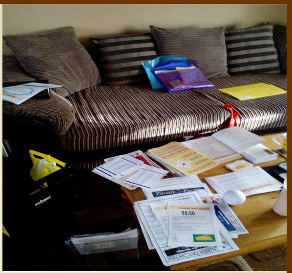
Pictured above: LPCF 'office' previously called a lounge.

7 pm. Time for homework; battle commences, sometimes one son refuses to do it.