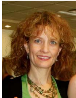
Shelly Brannon Innovation in Counseling Award (Denver)