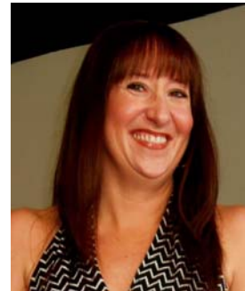
Michelle Skiba Leadership Award (Denver)