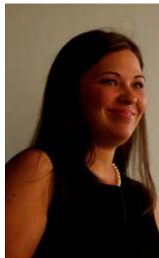
Lori Scheffler Outstanding Graduate Award (Denver)