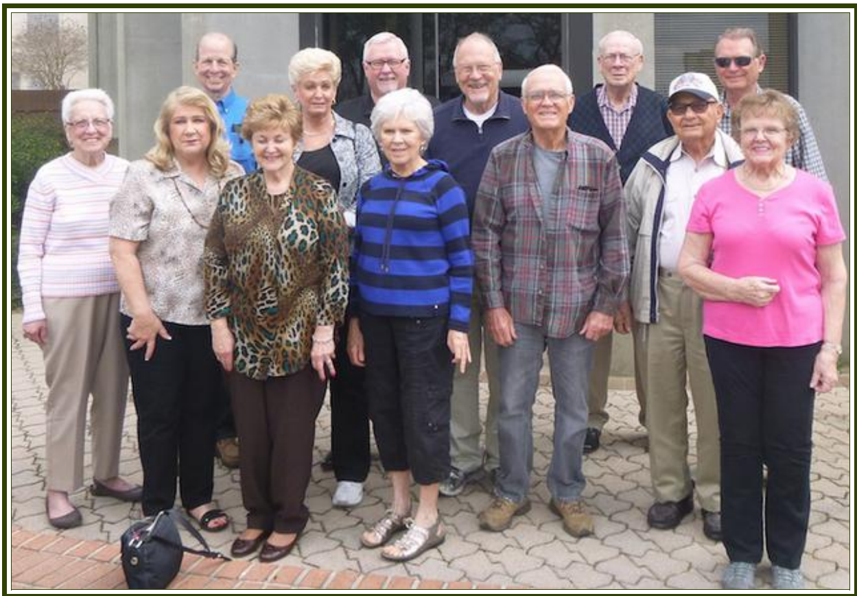
Explorers in front of Energy Museum

We left the Museum of the Gulf Coast about noon and traveled to Groves, Texas for lunch. We ate at Larry's French Market and Cajun Restaurant. The food was excellent with large portions. Our next stop was in Beaumont at the Energy Museum. Once again the museum was not too large, but the exhibits were exceptionally designed and very informative. The oil patch equipment on display looked as if it just came off the new equipment production line. Some of the equipment included oil delivery trucks from about 100 years ago, gasoline pumps, wellhead valve (Christmas Tree), drill bits, some offshore tools, and an interesting set of well cross sections during drilling and production.