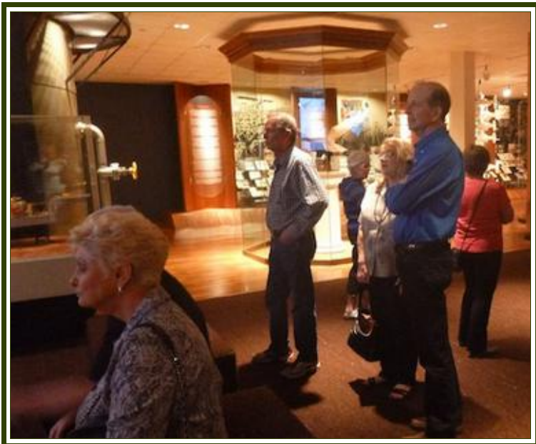
Explorers exploring the energy exhibits