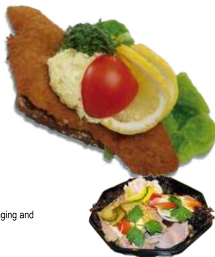
Art. no.: 1703

3 open luxury sandwiches, delivered in packaging and varies from day to day