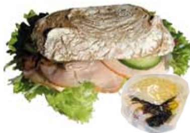
Art. no.: 1711

Sandwich, luxury, delivered in packaging and varies from day to day