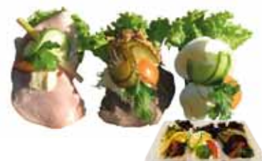
Art. no.: 1701

Sandwich, luxury, delivered in packaging and varies from day to day