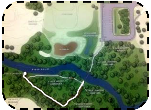
A preliminary draft of the boardwalk (shown in white) and other features that Wayne County Parks is contemplating.