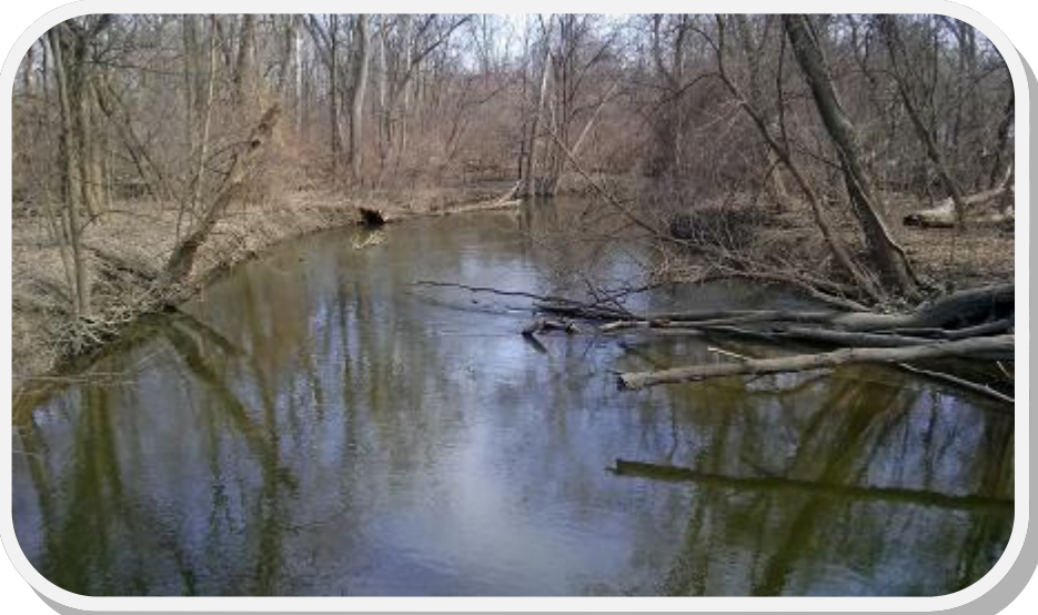
Tonquish Creek flows peacefully through the Preserve. Very soon the land turns a lush green and frogs start singing. Spring a great time to visit Holliday. Take time to walk it, watch, and listen.

We are also on Facebook where you will find news, recent photos and info on what is happening in Holliday. You can also post questions and comments.