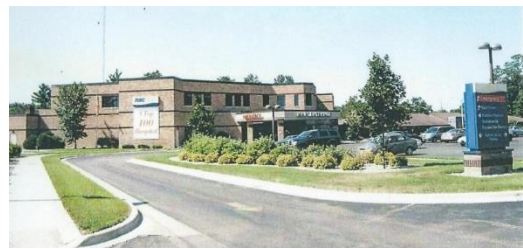
Riverside Medical Center and ThedaCare Physicians.