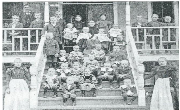
The Children's Home in the 1900's.

In Chapter Four (Bethany Events from 1980 – 1997) the articles, photos, and brochures highlight the expansion of the Bethany campus to include an 'Extended Living and Nursing Home', 'Assisted Living Apartments' and 'Independent Living Duplexes'.