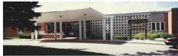
The Bethany Home in the 2000's.