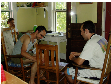
Catching up with fellow staff members in the kitchen