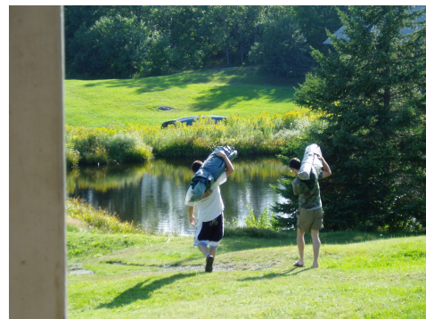
Lugging repaired tents to the Commissary

Maine High Adventure Staff Association 402 Metcalf Road Winthrop, ME 04364