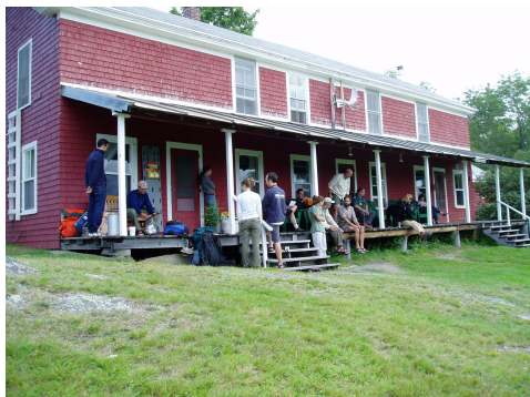
Serious "porch time"