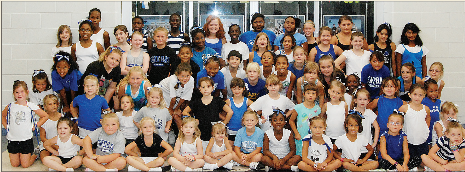
Nearly 70 cheerleaders participated in Cane Bay High School's second summer cheer camp at the school last week.