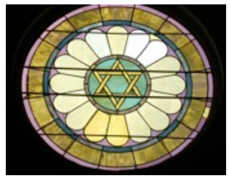
CBJ Stained Glass Window above the Balcony