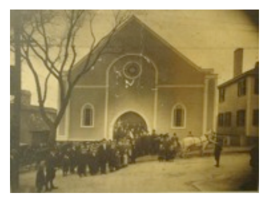
Early CBJ Congregation Photo