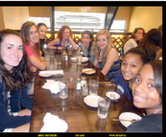
Modeling Camp NYC at lunch.

All girls should eat a healthy, well-balanced diet and maintain a regular exercise routine. Campers learn about health and nutrition and have their own personal yoga session with our Modeling Camp Nutritionist Keeley Mezzancello!