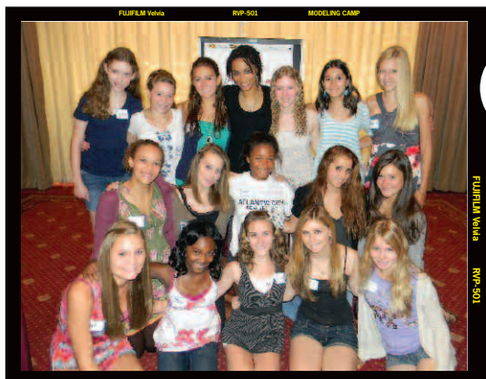
Modeling Camp NYC campers meet with Ashley Howard from America's Next Top Model!

VISIT WITH AMERICA'S NEXT TOP MODEL ALUMNI