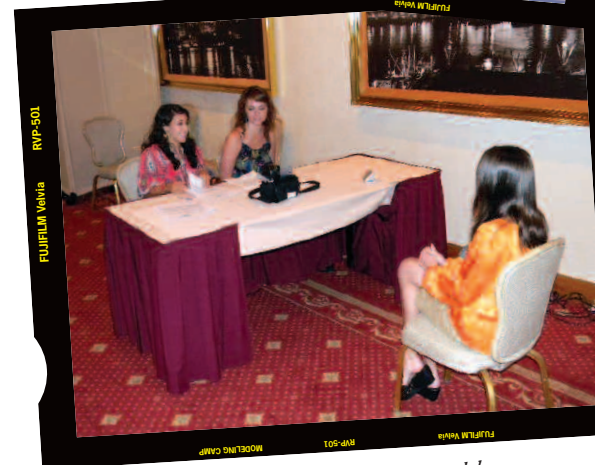
Modeling Camp girls being interviewed by MTV this summer.