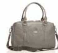
* ELIZABETH DOVE GREY