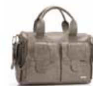
* SOFIA TAUPE