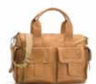
* SOFIA TAN