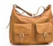
* EMILY LEATHER TAN