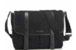
* AUBREY BLACK