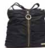
* JOOLS BLACK