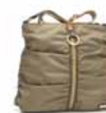
* JOOLS MOSS