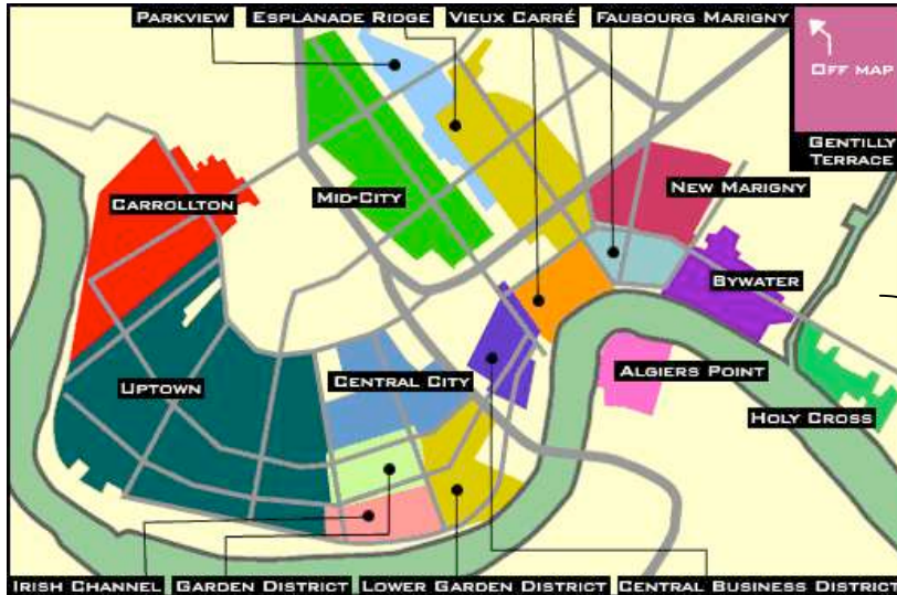
Greater New Orleans Area