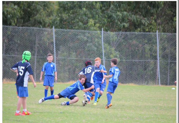
Our students who competed in the All Schools North Rugby League Competition