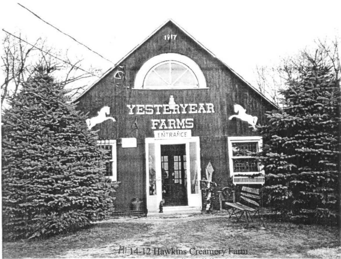
M: 14-12 Hawkins Creamery Farm Corn Crib Building/ Antiques Business Office