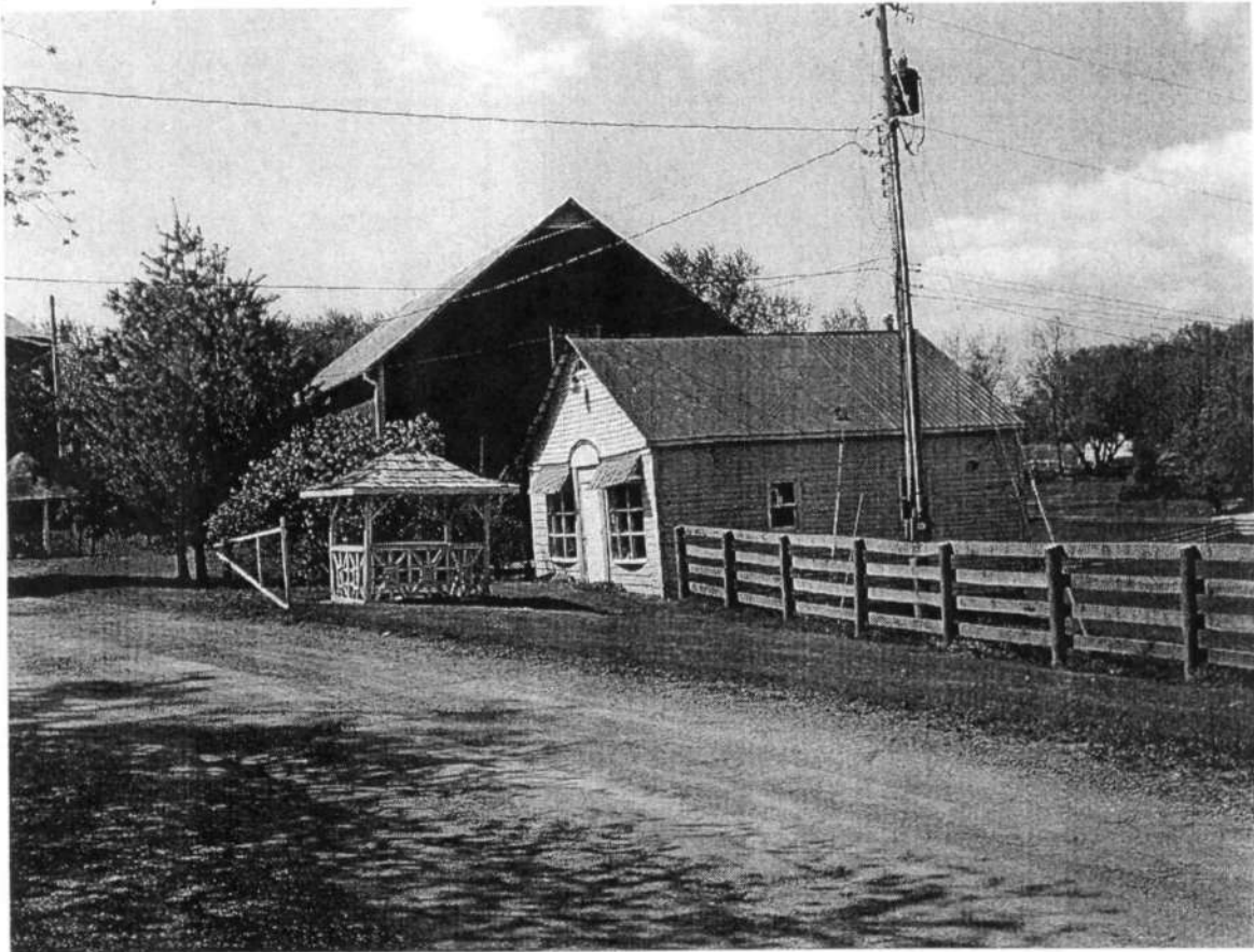
M: 14-12 Hawkins Creamery 7420 Hawkins Creamery Road