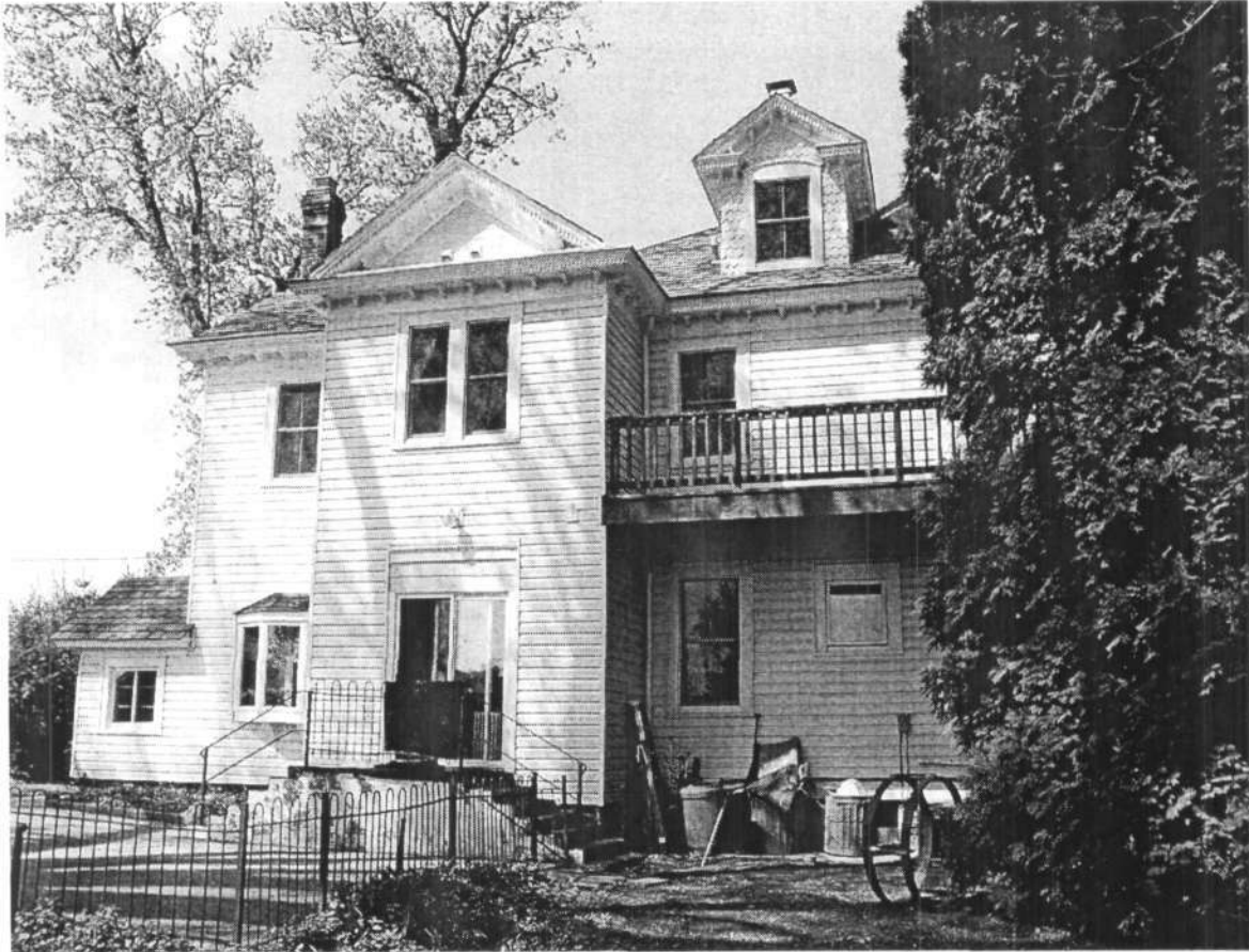
M: 14-12 Hawkins Creamery 7420 Hawkins Creamery Road