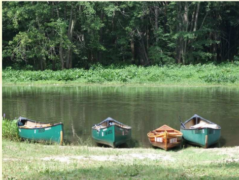
Members' canoes on the Cuyahoga River