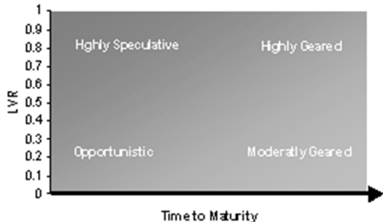
Time to Maturity