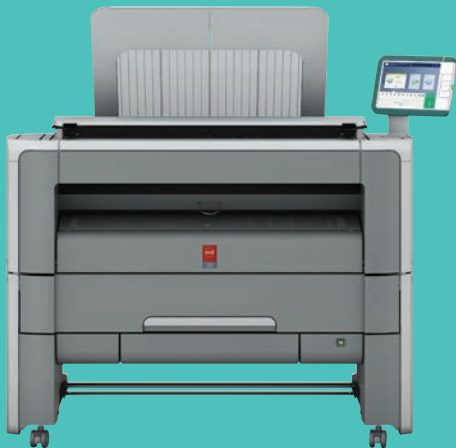
WITH OPTIONAL SCANNER EXPRESS II

You can access your projects' documents directly at the printer using the Océ ClearConnect multi-touch user panel. Are your files on a USB stick, on a network location or in the cloud? Just browse and swipe to your files and print them. In addition, you can scan directly to virtually unlimited destinations in the cloud or your Intranet. When you have a file on your iPad® mobile device, just use the WiFi infrastructure of your company to access the Océ PlotWave 340/360 printer and print via the Océ Publisher Mobile app. Or print from your desktop PC via Océ Publisher Select™ software to manage more complex document sets.