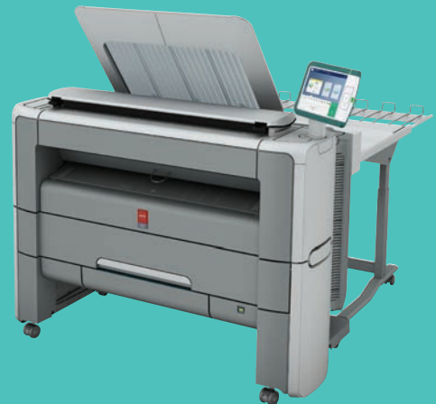
WITH OPTIONAL REAR DELIVERY TRAY