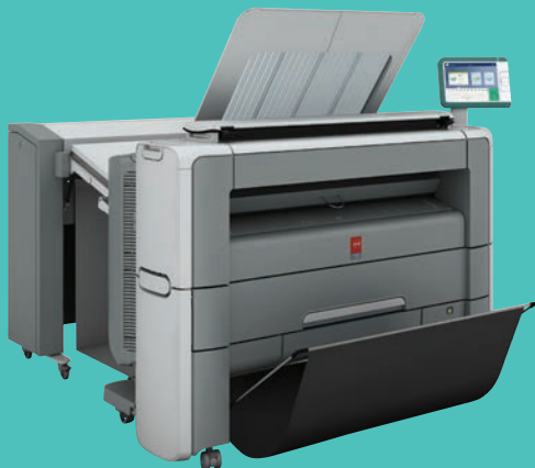
WITH OPTIONAL OCÉ ESTEFOLD 2400 FANFOLD