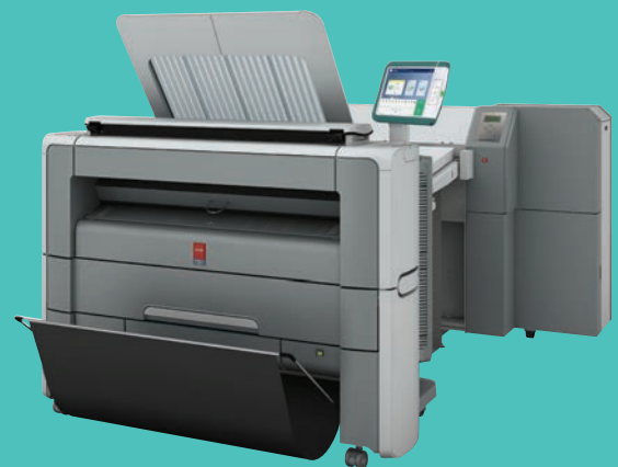
WITH OPTIONAL OCÉ ESTEFOLD 4312 FOLDER AND EXTENDED STACKER