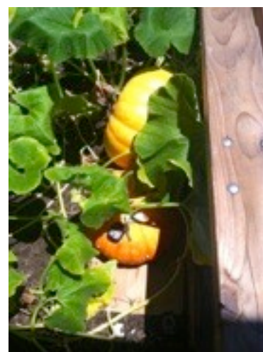
Last month and this month!

Dig in the Dirt... See how our garden grows!