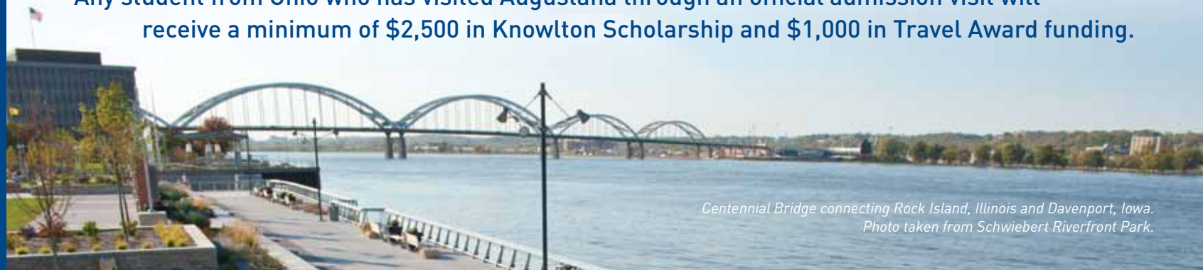
Centennial Bridge connecting Rock Island, Illinois and Davenport, Iowa. Photo taken from Schwiebert Riverfront Park.

Any student from Ohio who has visited Augustana through an official admission visit will receive a minimum of $2,500 in Knowlton Scholarship and $1,000 in Travel Award funding.