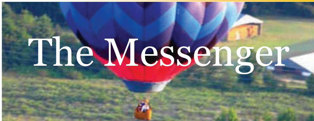
Balloon Ride, Chester, MD