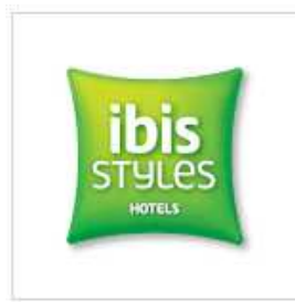
Pictures about the accommodation: Ibis Styles Budapest City *** Superior