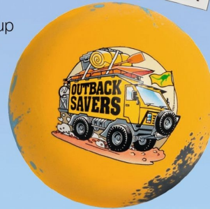
Mud Splat Handball