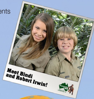
Meet Bindi and Robert Irwin!

For more tips, videos and activities to stimulate your child's interest in money skills, head to The Beanstalk at commbank.com.au/youthsaver