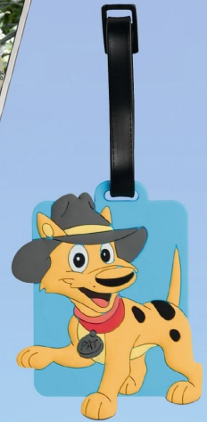
Outback Pat Bag Tag