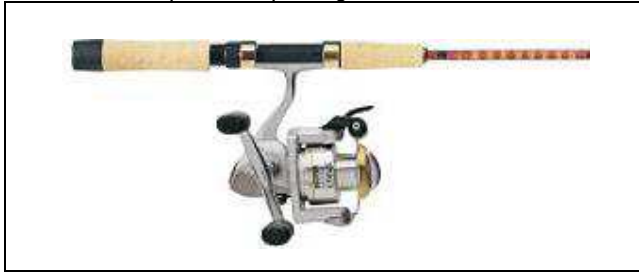
Example of a Spinning Rod & Reel