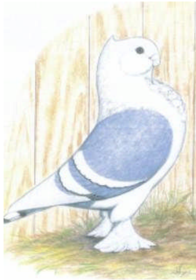
Blue Bar Satinette

The Old-fashioned Frills, better known as “Classic Frills”, is an exhibition breed of pigeons from the Owl Family. The Classic Frill is the original, precursor breed of Oriental Frills that have been bred to create the modern show type Oriental Frill with is a much larger bird with a short face. It is a beautiful ancient pigeon breed. Two reasons why the classic version has survived is that many were using them as dropper for flying breeds such as the Racing Homers and that they are able to feed their young.