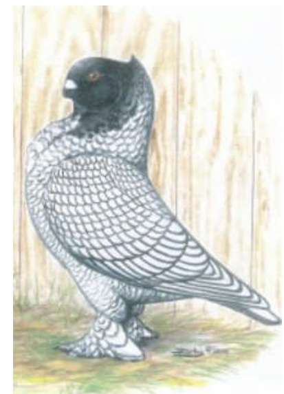
Black Laced Blondinette

Members’ Handbook New Club Patch Additional Club Items Club Auctions Additional Standard drawings in both Satinettes & Blondinettes