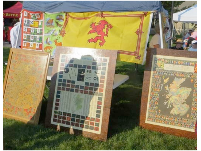
Grand Traverse Pipes and Drums annual concert on the lawn