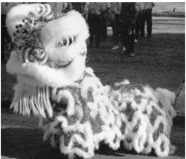
Don't miss the Chinese Lion Dancing today in the Coral Lounge in the conference center. For more information, see page 2.

practicing their skills. To be a Lion Dancer, one must have been training in traditional kung fu for at least a year. We invite you to play with us and feel the energy of the Lion.