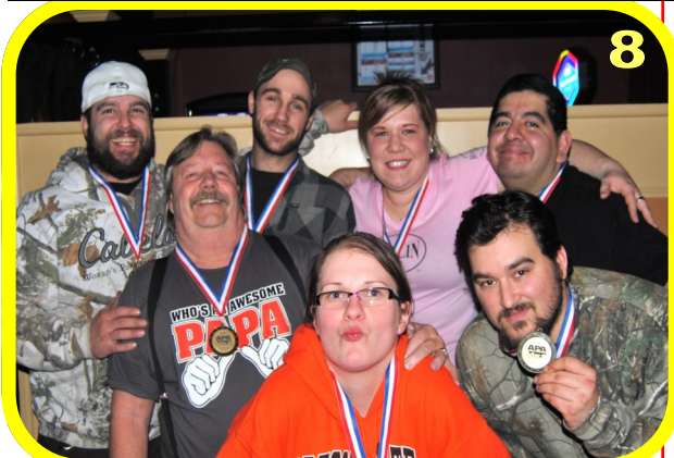
GOLD -- Ridonkulous