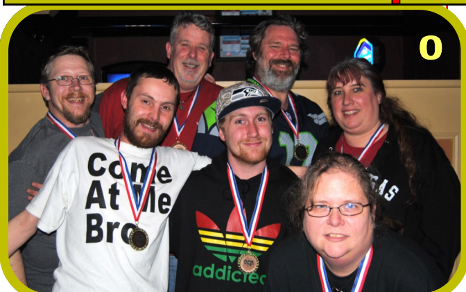
BRONZE -- Yay Beer