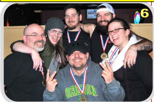
PLATINUM -- Poke & Hope