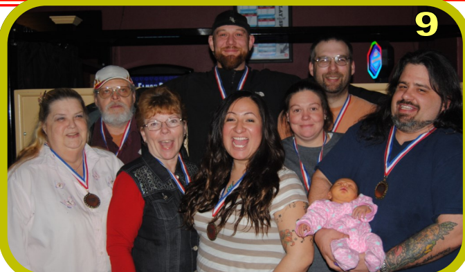
BRONZE -- Just The Tip