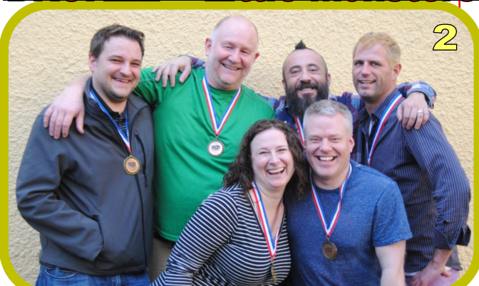
BRONZE -- The Hit Squad