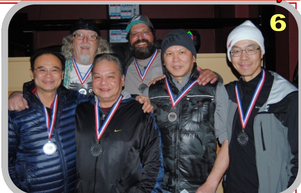
SILVER -- City Hunters