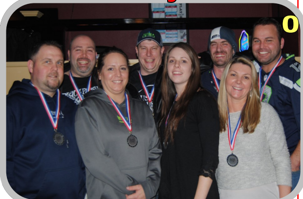
SILVER -- Under8ted