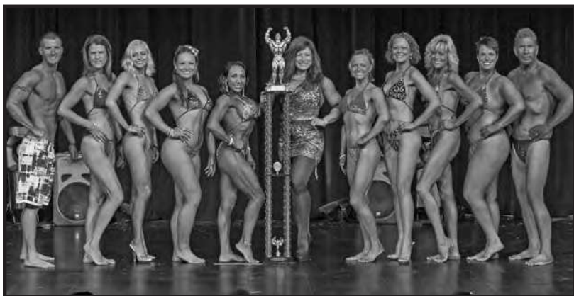
2015 NPC Grand Prix Natural Team Trophy Winner