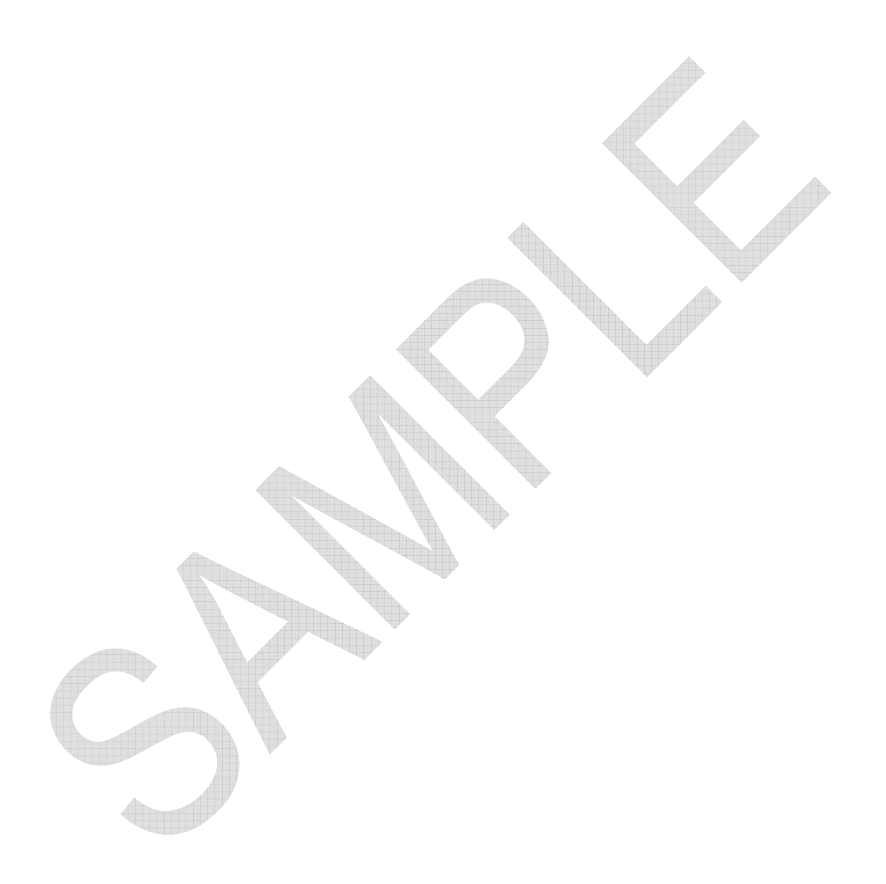
EXHIBIT A - PROJECT DESCRIPTION