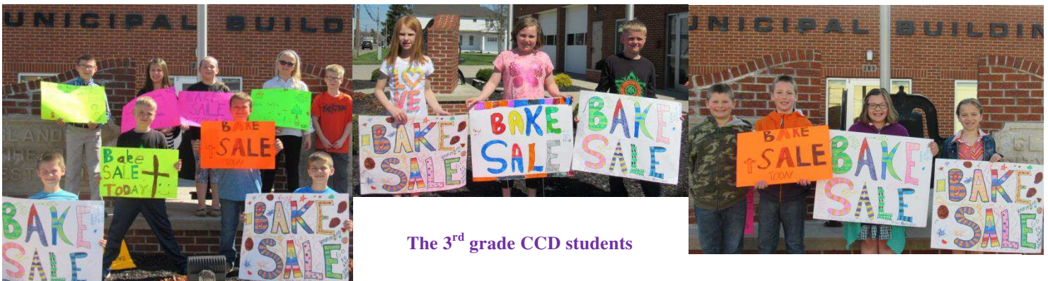
The 3 rd grade CCD students

Vacation Bible School is fast approaching and we are in NEED of CREW LEADERS! A crew leader guides a group of 6-7 children from one activity to the next! Come join us for a spiritual, fun-filled week of following Jesus-the Light of the World! Grandparents, aunts, uncles, moms and dads-- please consider being a crew leader even if you can only offer a few days! Please call or text Barb Duling as soon as possible, 419.615.9308!