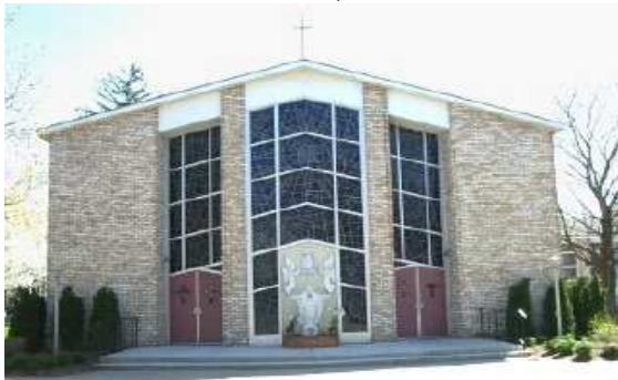
Infant Saviour, Pine Bush