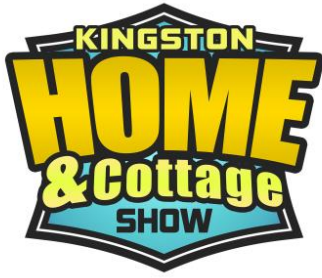
Exhibit Space Application March 20 – 22, 2015 Kingston 1000 Islands Sportsplex 1485 Westbrook Rd. Kingston, Ontario K7N 3A1