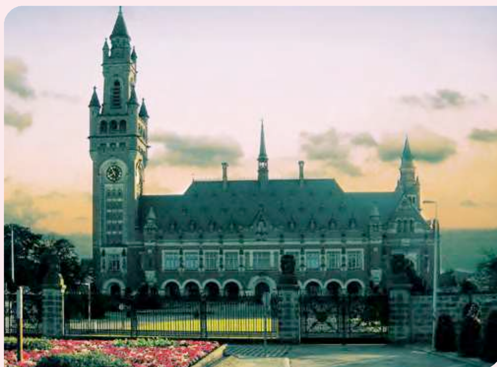
Peace Palace, The Hague

Part-time programme: The part-time programme is ideal for those people who wish to combine studying for an LL.M. degree with work/family commitments. Compulsory subjects are taught in the evenings (as well as during the day).