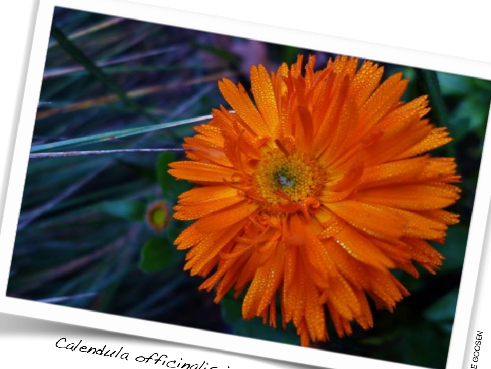
Calendula officinalis in WPA Rock Garden

Sacramento Perennial Plant Club Membership—2016