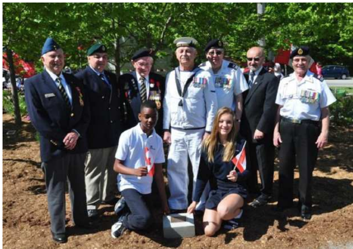
Veterans and kids from St Dominic's School in Oakville